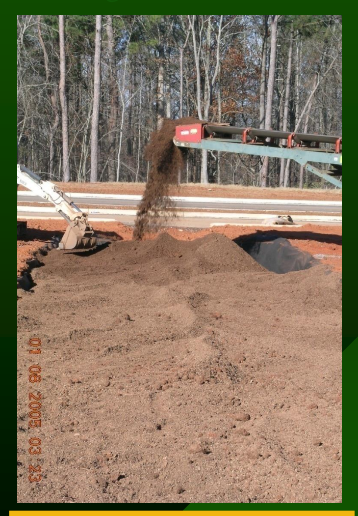
Conveyer or Blow Soil Into Place to Alleviate Over-Compaction