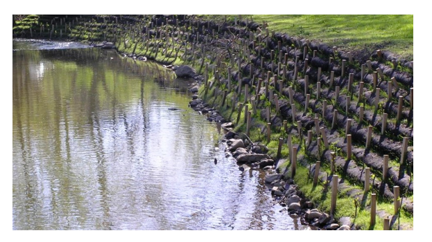
MCS Inc. streambed restoration project using compost. www.mcsnjinc.com