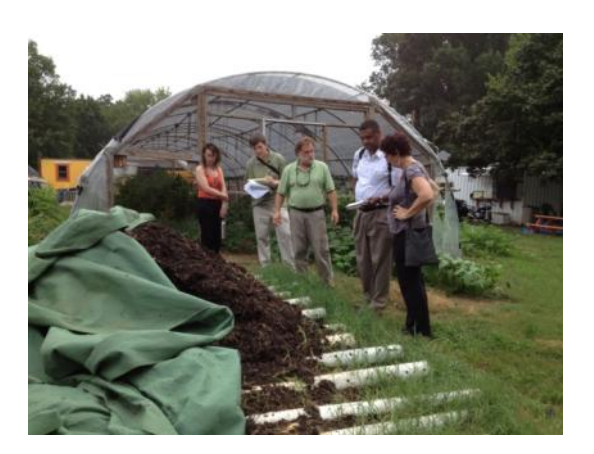
Low-tech aerated static pile composting system at Eco City Farms, Edmonston, Maryland.

Vermicomposting or worm composting is another type of process that decomposes organic materials into a rich humus or soil amendment using special species of worm. Eisenia fetida , commonly called red wigglers, are the most popular.