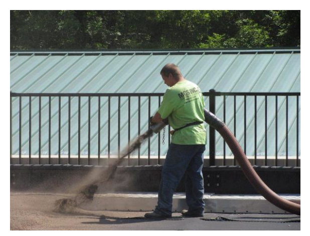
MCS Inc. worker installing growing media made from compost on green roof. www.mcsnjinc.com

30 to 35 FTE employees, four of whom work on compost projects.<sup>19</sup>