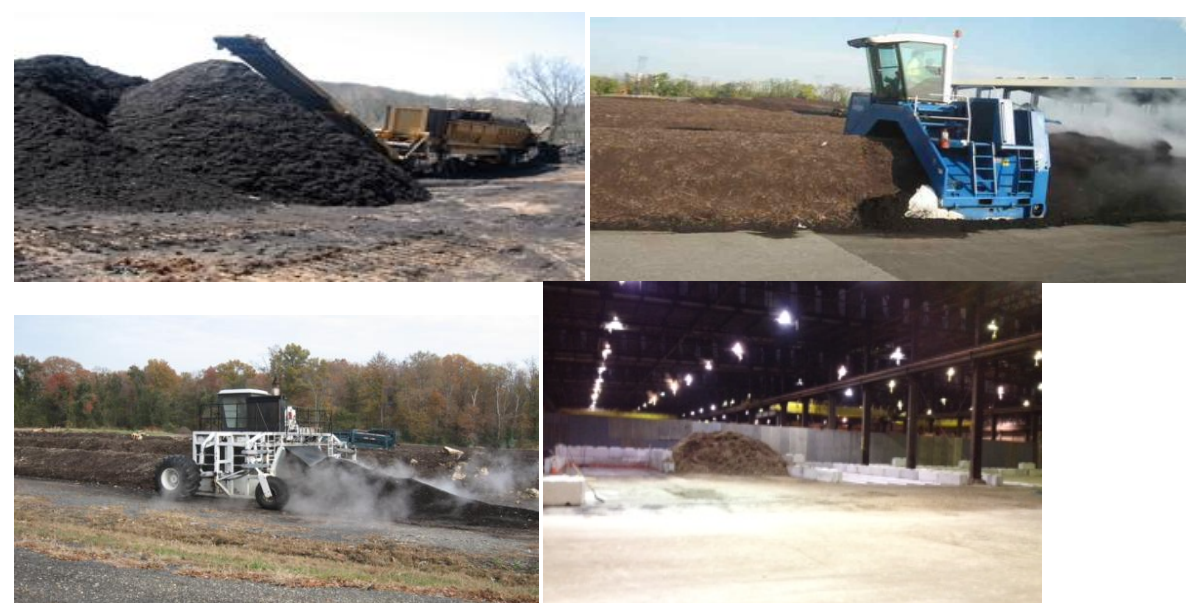
Clockwise from top left: 1. Finished compost at Recycled Green Industries in Woodbine. 2. Windrow turner at Montgomery's County's yard trim composting site in Dickerson. 3. Chesapeake Compost Works new food scrap composting site in Baltimore. 4. City of College Park's yard trim windrow turner at work.

In the 2013 legislative session, The MD Assembly passed HB 1440: Recycling-Composting Facilities (introduced by Del. Heather Mizeur), a bill that will advance composting by allowing the MD Department of the Environment (MDE) to establish a permit system for composting facilities and exclude source-separated materials from being regulated as a solid waste. The bill paves the way for MDE to address the regulatory hurdles facing MD composters and create a clear regulatory pathway for composting facilities.