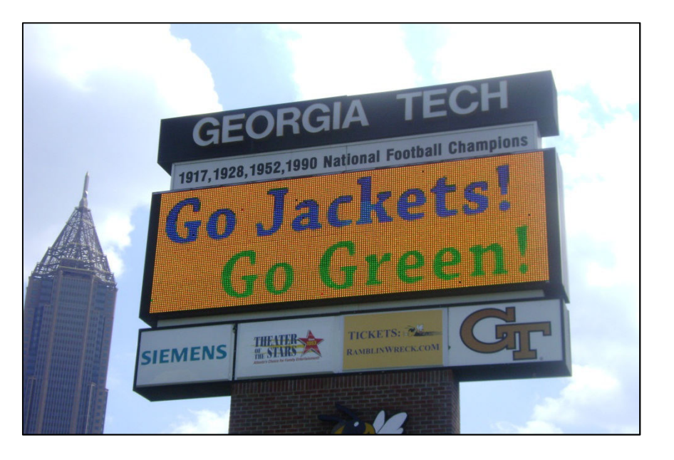
Waste Age magazine, January 2013